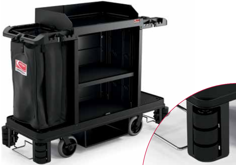
HKCBAG05 Standard hanging bag included with cart

HKC2000 DIMENSIONS 61.25" L x 24" W x 49.75" H WEIGHT 104 LBS